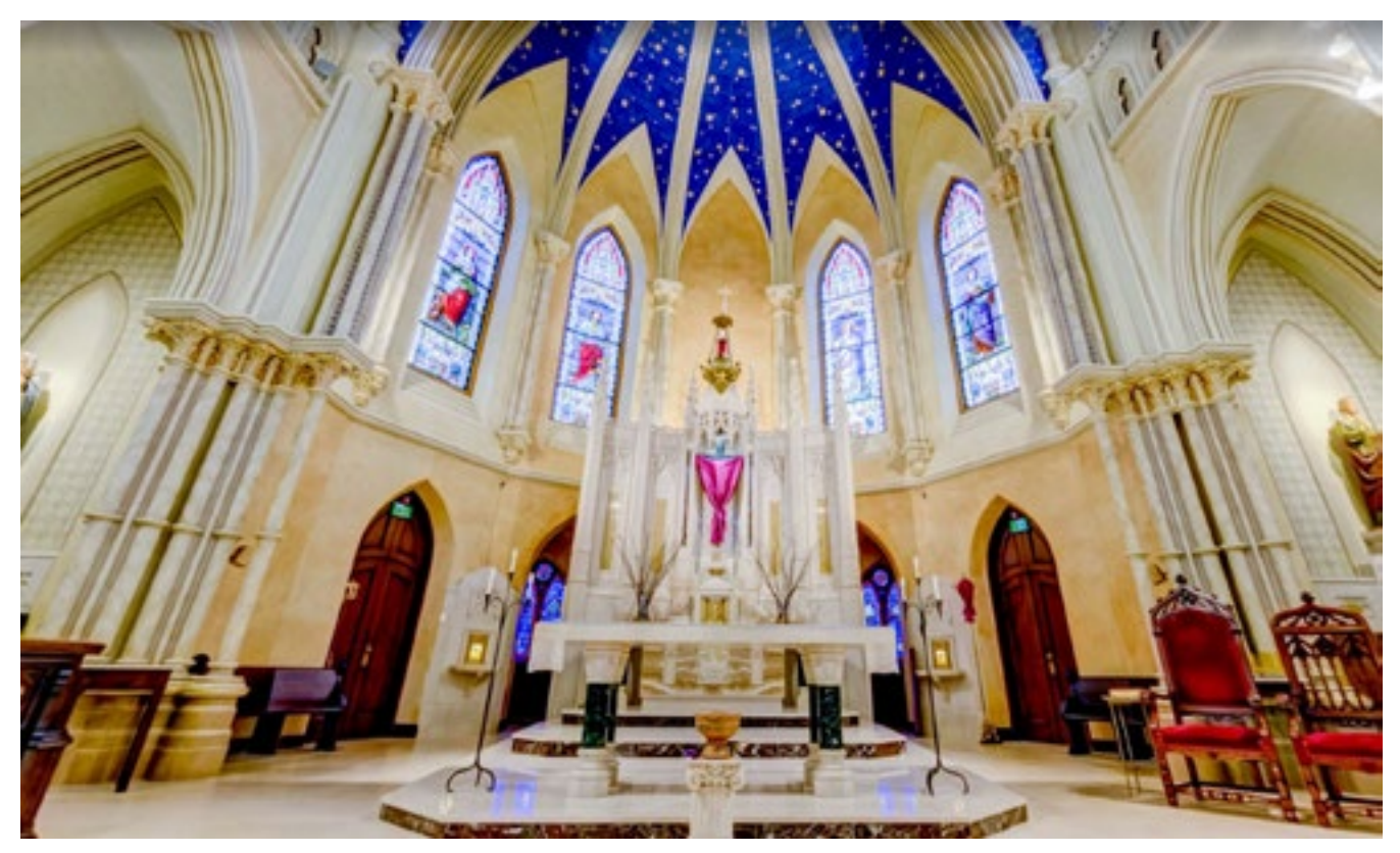
Ken Foster, Google Images